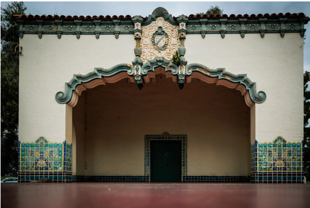
A view of the facade of the Recreation Park Bandshell in Long Beach on June 12, 2023.